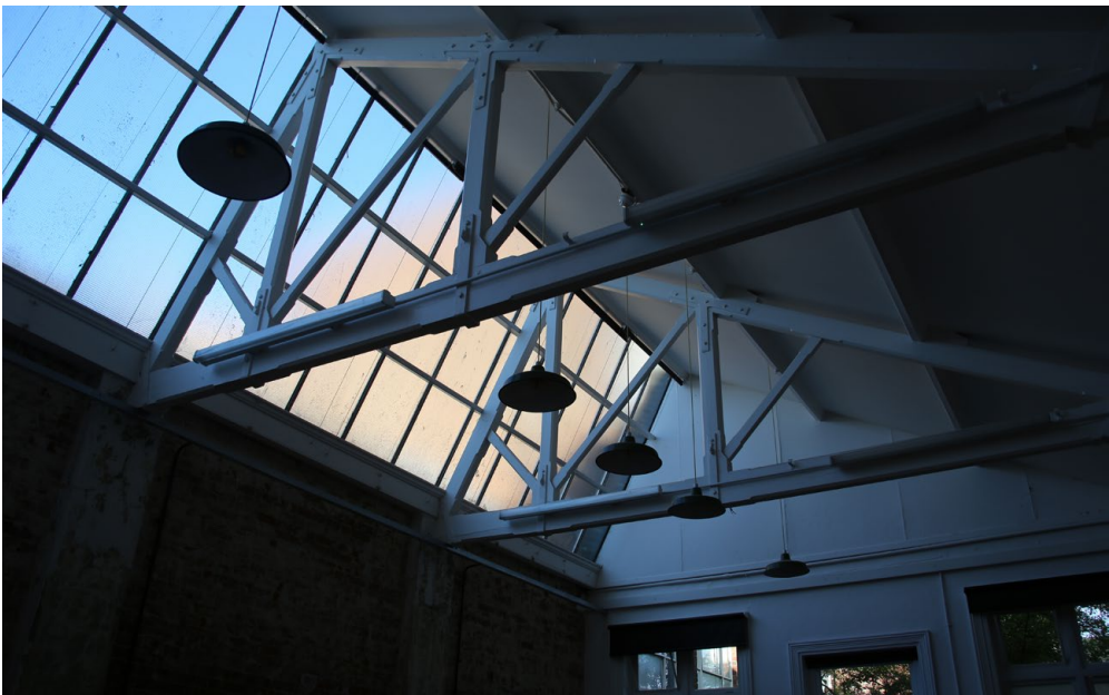
The Think Tank has wooden floors and high ceilings with roof lights.