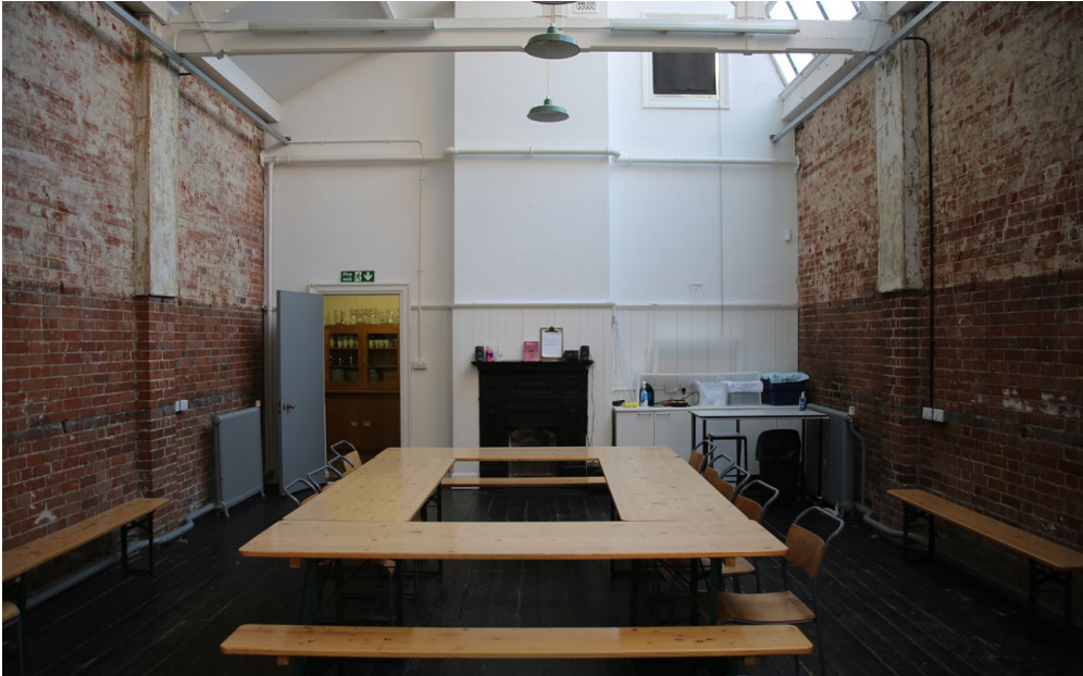
The Think Tank room.